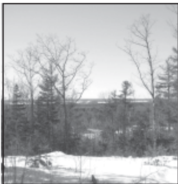
Newman Hill winter 2005